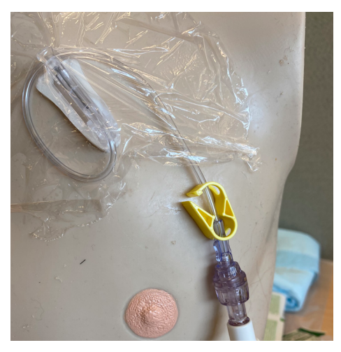
PORT A CATH

The Elastomeric Infusor™ which is sometimes called "baby bottle" contains a type of chemotherapy called fluorouracil or 5FU for short.